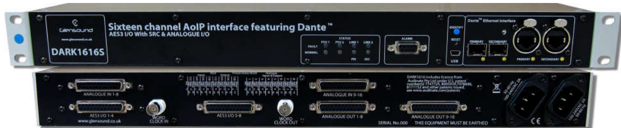
DARK1616S Dante® Network Audio Interface